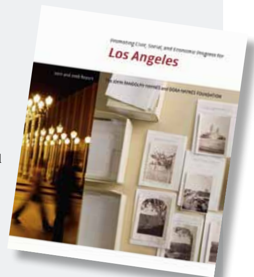
Haynes Biennial Report 2007-08

As a private, independent foundation, the Haynes Foundation uses its website as a tool to broaden its outreach to scholars, policy makers, and members of the public who are interested in social science research relating to Los Angeles. More information can be found at www.haynesfoundation.org . Helpful features to be found there include a brief history of the Foundation, information about its founders and trustees, descriptions of the Foundation's programs, procedures for preparing and submitting grant and fellowship proposals, electronic copies of recent Newsletters and Biennial Reports (see latest cover at right), office contact information and a list of Frequently Asked Questions.